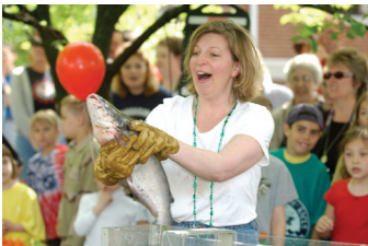
Paris Fish Fry, Paris