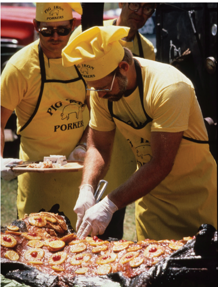
Memphis in May International Festival

http://www.tnvacation.com/vendors/lauderdale_county_tomato_festival