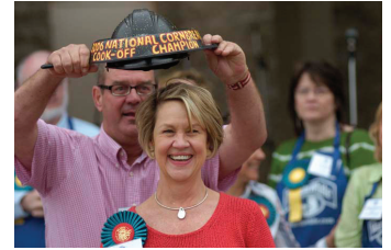
Cornbread Festival, South Pittsburg