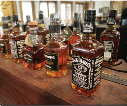
Jack Daniel Distillery, Lynchburg