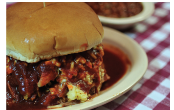
Neely's BBQ, Memphis