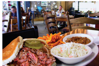
Puckett's BBQ, Franklin