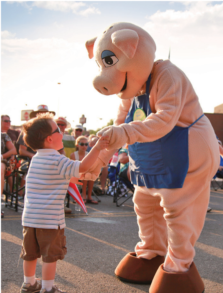
Bloomin' BBQ & Bluegrass, Sevierville