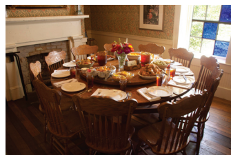
Miss Mary Bobo's, Lynchburg