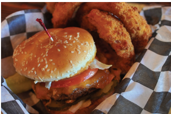
Huey's Midtown, Memphis