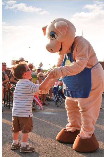
Bloomin' BBQ & Bluegrass, Sevierville