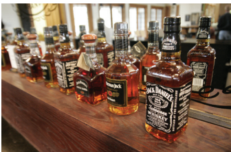
Jack Daniel Distillery, Lynchburg