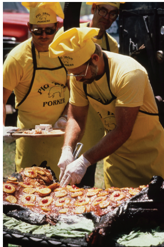
Memphis in May Festival