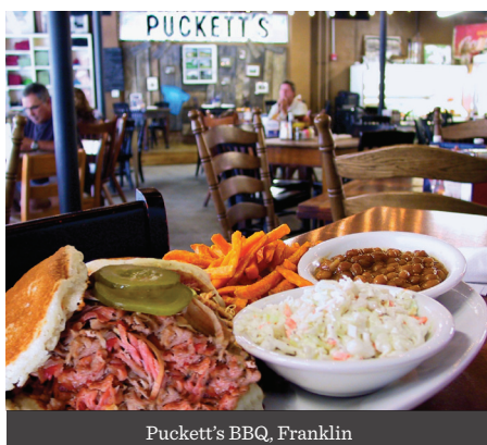
Puckett's BBQ, Franklin