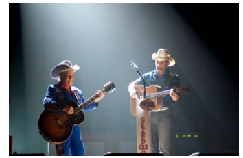
Little Jimmie Dickens and Brad Paisley at the Grand Ole Opry, Nashville