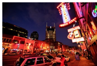
Nashville, Honky Tonks