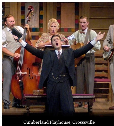
Cumberland Playhouse, Crossville