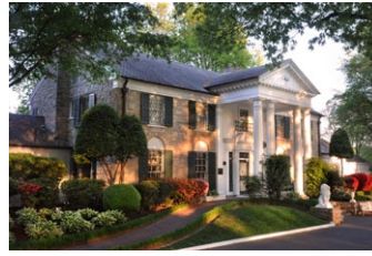
Elvis' Graceland, Memphis