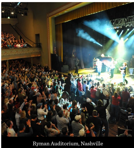
Ryman Auditorium, Nashville

Classical music can be found in every major city—and a few smaller ones. Visit the beautiful Schermerhorn Symphony Center in Nashville, at the Orpheum in Memphis, or the state theater in Knoxville, The Tennessee. Chattanooga, Kingsport, Cookeville and Jackson all boast accomplished orchestras.