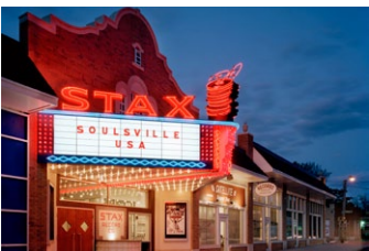
Stax Museum of American Soul Music, Memphis