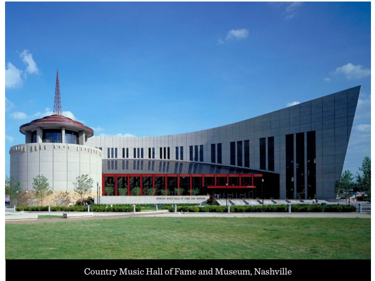
Country Music Hall of Fame and Museum, Nashville

Three Sisters Music Festival, on the Chattanooga riverfront every fall, features top names in contemporary and traditional bluegrass. And the flavor tends toward bluegrass at the Mountain Opry on Signal Mountain. As you're leaving Chattanooga,