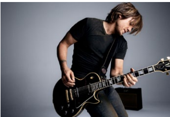
Keith Urban, Nashville