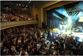
Ryman Stage, Nashville