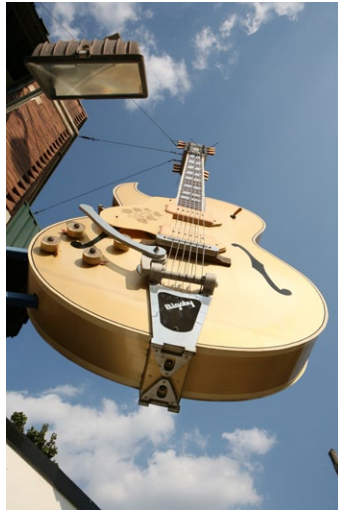
Sun Studio Exterior, Memphis