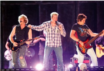
Rascal Flatts, Nashville