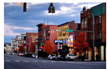
Nashville, Honky Tonks