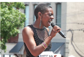
Mountain Soul Vocal Competition, Bloomin' BBQ & Bluegrass