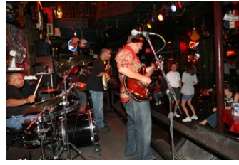
Beale Street, Memphis