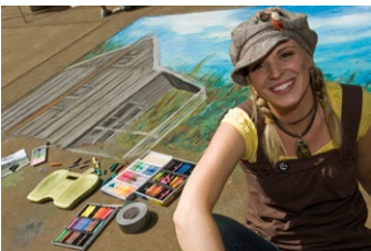
Dogwood Arts Festival, Knoxville