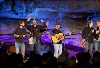
Bluegrass Underground - Mountain Heart, Cumberland Caverns, McMinnville

Go online to the photo gallery and download the high resolution image.