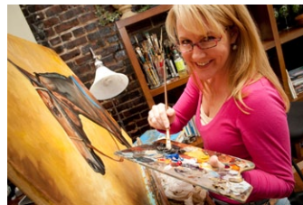
Downtown Art, Kingsport