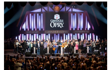
Grand Ole Opry, Nashville