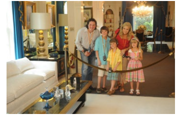
Elvis' Graceland, Memphis