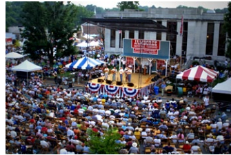
Smithville Jamboree Festival, Smithville