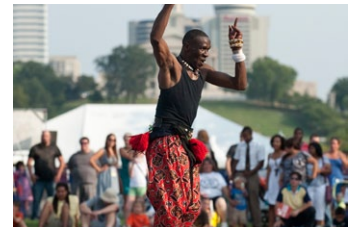
International Folk Festival, Nashville