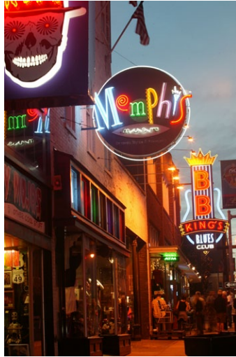
Beale Street, Memphis