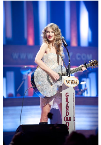
Taylor Swift - Grand Ole Opry, Nashville