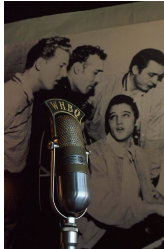
Sun Studio, Memphis