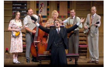
Smoke on the Mountain - Cumberland Playhouse, Crossville