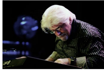
Michael McDonald at Franklin Theatre