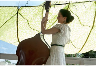
St. Patrick's Day Irish Picnic, McEwen