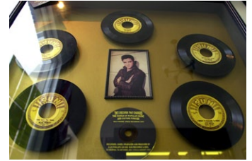
Rockabilly Hall of Fame, Jackson