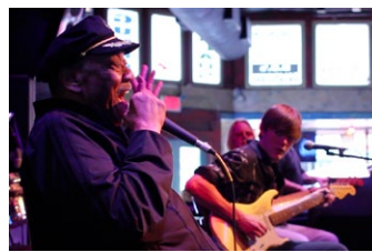
Blues on Beale Street, Memphis