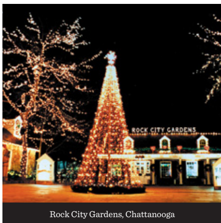
Rock City Gardens, Chattanooga

Listed on the National Register of Historic Places, Collierville shows off its town square with quaint, one-of-a-kind boutiques, numerous antique stores, specialty shops and an old-fashioned gas station.