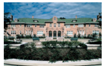
Pink Palace Museum, Memphis