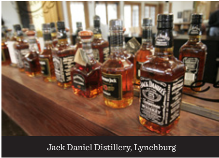
Jack Daniel Distillery, Lynchburg

Sweet confections, tangy sauces, famous whiskeys and smoky flavors are all part of the unforgettable tastes of Tennessee. Try our bodacious barbecue, crispy cornbread, gourmet treats and award-winning wines.