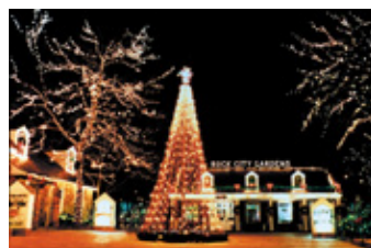
Rock City Gardens, Chattanooga