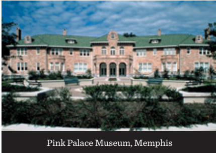
Pink Palace Museum, Memphis

Fisk University Galleries, Nashville http://www.tnvacation.com/vendors/fisk_university_galleries/