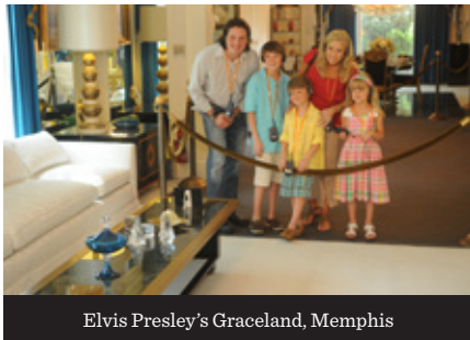
Elvis Presley's Graceland, Memphis

Tennessee has an abundance of museums, cultural and sporty, whimsical and serious. Stop by the gift shop for a reminder of your travels.