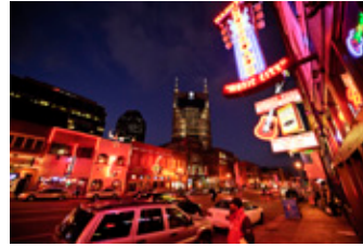
Nashville, Honky Tonks