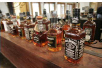
Jack Daniel Distillery, Lynchburg