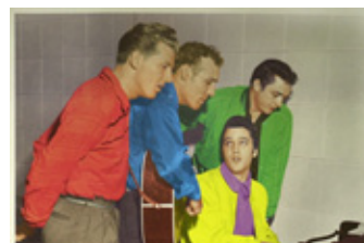
International Rock-A-Billy Hall of Fame & Museum, Jackson