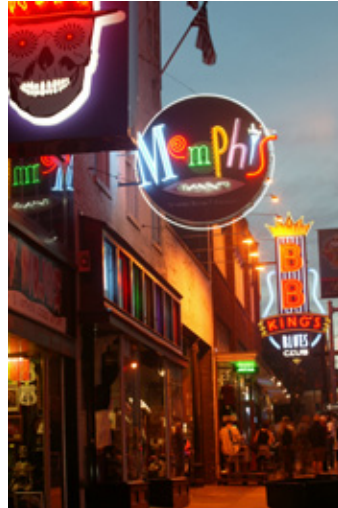
Beale Street, Memphis