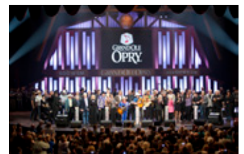
Grand Ole Opry, Nashville