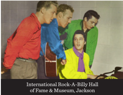
International Rock-A-Billy Hall of Fame & Museum, Jackson