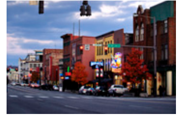
Nashville, Honky Tonks