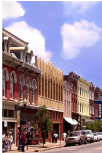
Main Street, Franklin