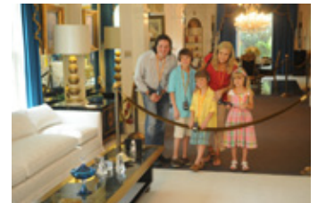
Elvis' Graceland, Memphis